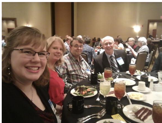
CALLERLAB, The International Association of Square Dance Callers